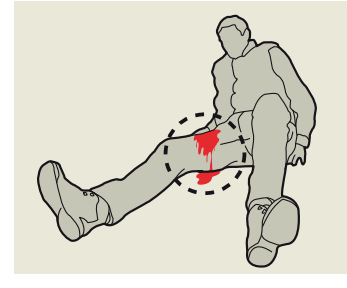
Identify massive hemorrhage